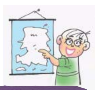
So, it happens all over the world, even in Europe! I thought it was only in countries like India that we have social divisions.

reached a peace treaty after which the latter suspended their armed struggle. In Yugoslavia, the story did not have a happy end. Political competition along religious and ethnic lines led to the disintegration of Yugoslavia into six independent countries.