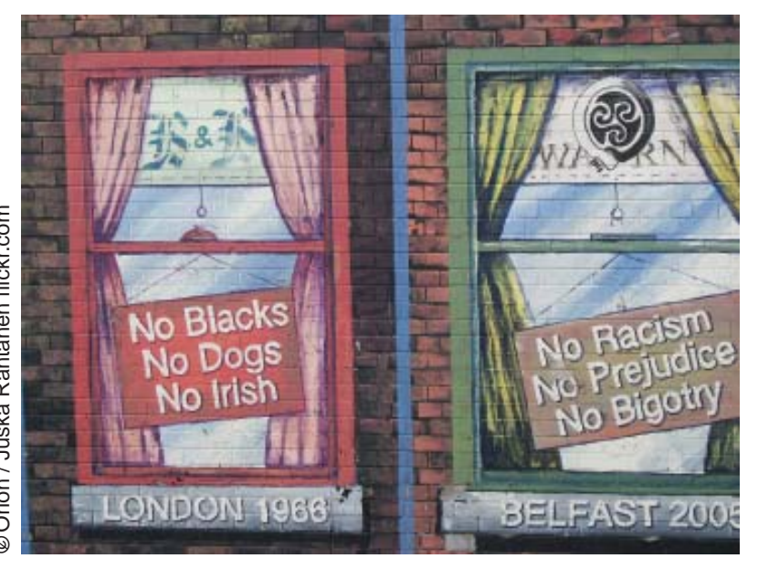
In some societies of Northern Ireland, the colonies of Protestant and Catholic communities are divided by walls. These walls are sometimes filled with graffiti as you can see here. The Irish Republican Army and British Government signed an agreement in 2005. What does the graffiti here tell about the conflict in the society?

At the same time every expression of social divisions in politics does not lead to such disasters. We have already seen that social divisions of one kind or another exist in most countries of the world. Wherever they exist, these divisions are reflected in politics. In a democracy it is only natural that political parties would talk about these