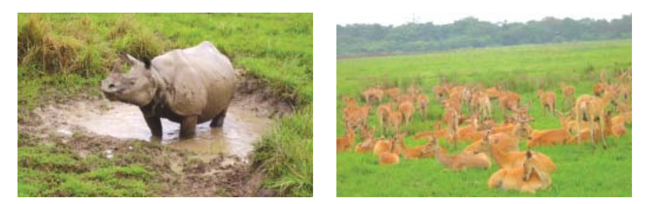
Fig. 2.4: Rhino and deer in Kaziranga National Park

horned rhinoceros, the Kashmir stag or hangul, three types of crocodiles – fresh water crocodile, saltwater crocodile and the Gharial , the Asiatic lion, and others. Most recently, the Indian elephant, black buck (chinkara), the great Indian bustard ( godawan ) and the snow leopard, etc. have been given full or partial legal protection against hunting and trade throughout India.