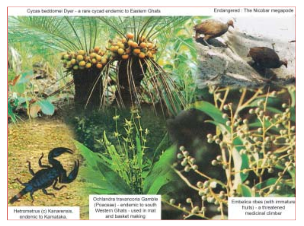
Fig. 2.2: A few extinct, rare and endangered species

Asiatic Cheetah: where did they go? The world's fastest land mammal, the cheetah (Acinonyx jubantus), is a unique and specialised member of the cat family and can move at the speed of 112 km./hr. The cheetah is often mistaken for a leopard. Its distinguishing marks are the long teardropshaped lines on each side of the nose from the corner of its eyes to its mouth. Prior to the 20th century, cheetahs were widely distributed throughout Africa and Asia. Today, the Asian cheetah is nearly extinct due to a decline of available habitat and prey. The species was declared extinct in India long back in 1952.