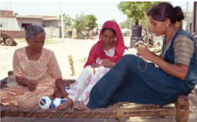
Women at home in Ludhiana making footballs for large MNCs

There's another way in which MNCs control production. Large MNCs in developed countries place orders for production with small producers. Garments, footwear, sports items are examples of industries where production is carried out by a large number of small producers around the world.